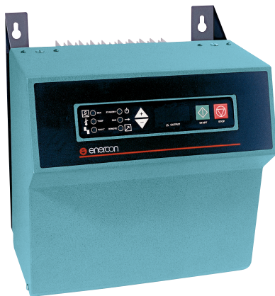
Compak™ 2000 Power Supply