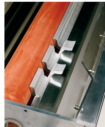
Electrode segments in and out of treatment position to allow lane treatment.