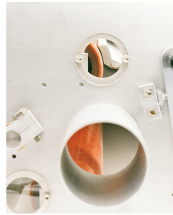
Port provided in end plate permits viewing of electrode air-gap during operation.