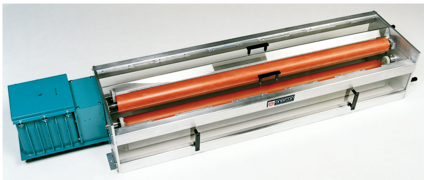
Blown Film Station with Optional High Voltage Transformer Bracket Mounted.

The Enercon Blown Film Treater is the culmination of a quarter century of application experience in meeting the specific requirements for surface treatment on blown film extruders. Compact, simple construction that allows for 2-side treating and adjustable lane treating meets all the basic application needs. Add to that, a station that is visually open, easy to thread and an electrode system that provides simple, trouble-free air-gap adjustment. Finally, compare the price of this system with any other. Now you have the ultimate in Blown Film Treating!